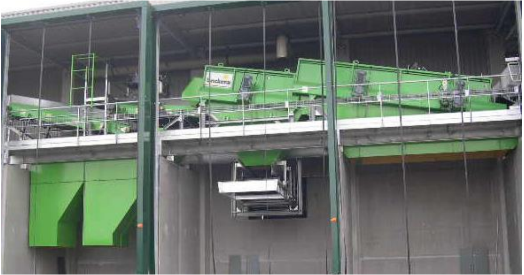
2 starscreendecks in series with an electric drive.