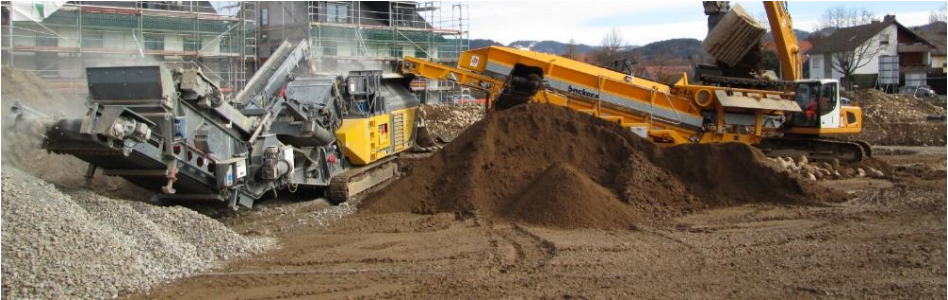
Starscreen 2-ta with impact breakwater

Overburden, clay soils and red layer are easily cleaned with the starscreen and then crushed with an impact breakwater. This produces clean and easily recyclable material flows. Screening first, followed by crushing.