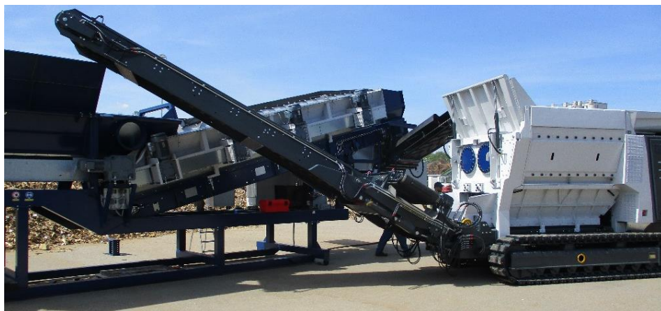
2 breakwaters of performance class 30t/h with starscreen 2-sbe

However, the slow-moving breakwaters cannot reduce the waste wood to the desired length in one operation. The starscreen sifts out the fine material and conveys the excess lengths back into the breakwater.