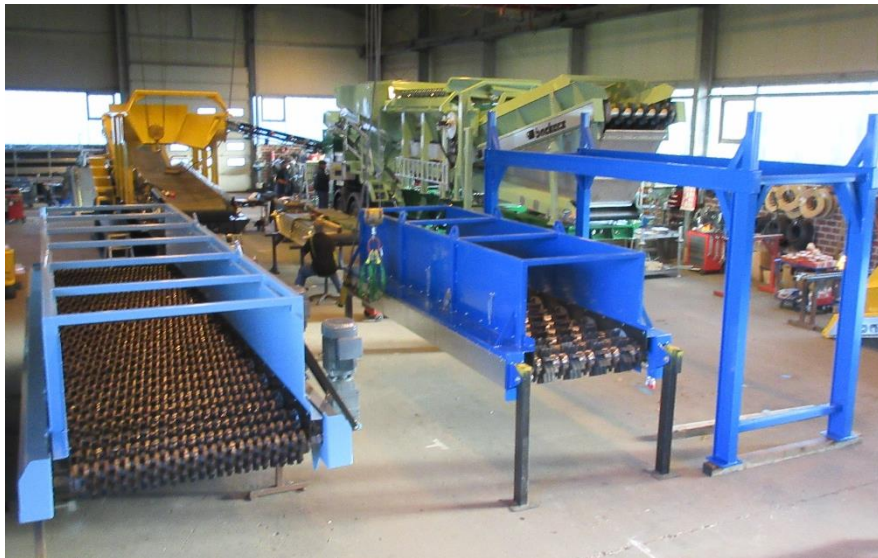
Assembly hall for the production of stationary and mobile star screens at the Twist site.

Backers Maschinenbau GmbH manufactures star screening and mixing technology for stationary and mobile applications. The portfolio also includes pre-separators such as bar grates and grizzly screens, as well as separation technology with magnetic separators and air classifiers.