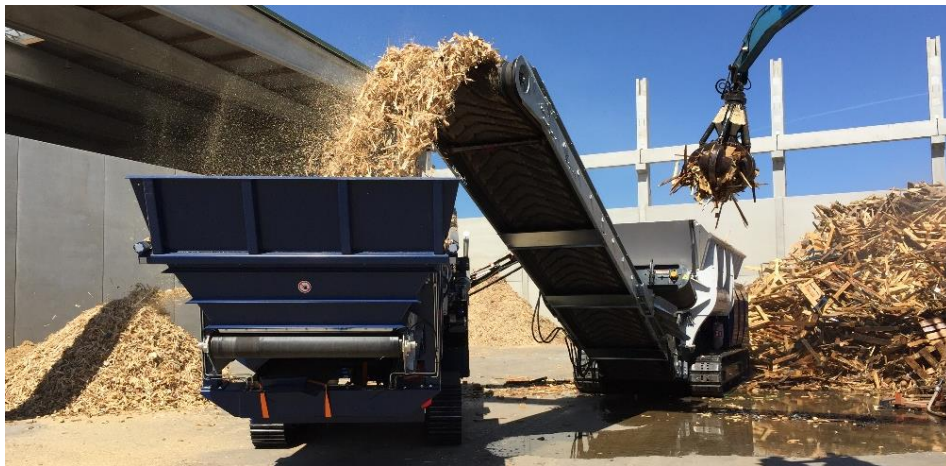
2 breakwaters of performance class 50t/h with starscreen 2-tb17

Backers starscreens are also used for screening organic materials. Here, the procedure consists of first breaking and then sifting.