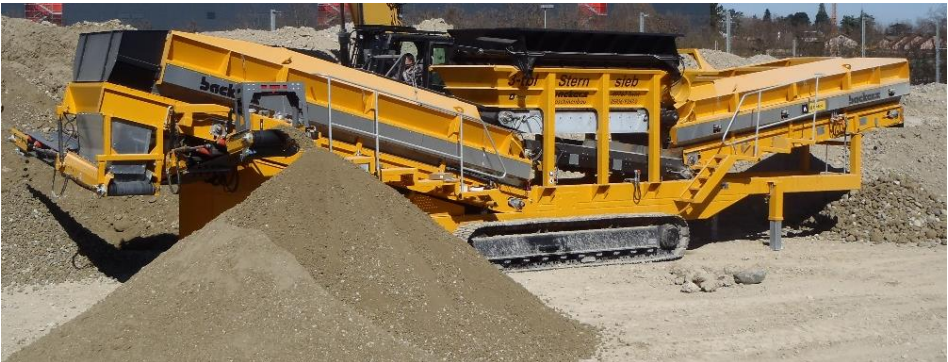
Starscreen 3-tbl+ (with bar grate and longer coarse screen)

The newly developed “grizzlyscreen” on the material feed hopper is equipped with strongly mounted, rotating rollers. It is filled by an excavator or wheel loader and separates material larger than 200 mm. Cohesive soil is loosened at the same time and then sifted on starscreen 2-ta at a separation size of 22/25 mm. The cleaned stones are then fed to the impact breakwater and crushed. In this way, very clean material is produced with very high output in a single operation. The well-cleaned stones from the clay soil can therefore be used as a frost layer. The screened soil can be used as fill material (on site).