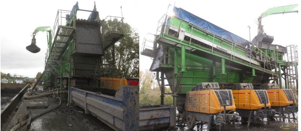
Starscreen with 1.7 m screen width as a protective screen for a sewer excavation feed pump. Screening is implemented at a diameter of 60 mm and a maximum length of 180 mm. The fine fraction is delivered 500 - 800 m by 3 concrete pumps.