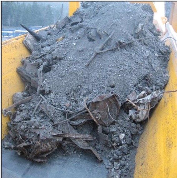
Material in its original state in the hopper